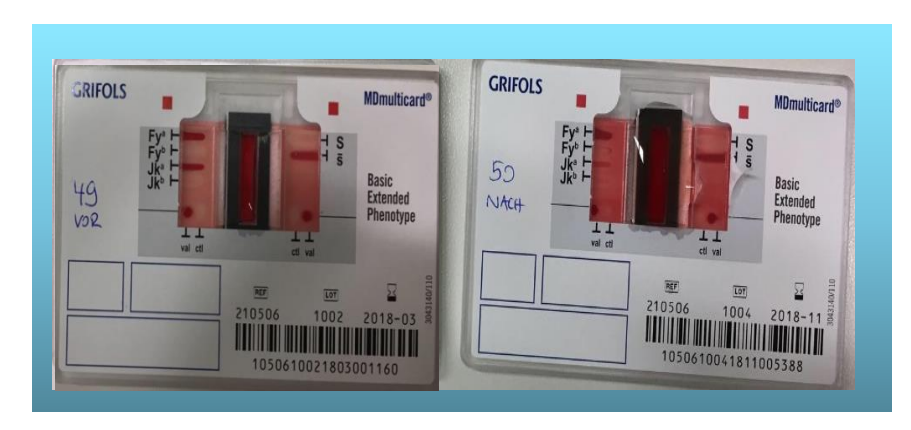
Figure 4: Sample of a patient before and after incompatible transfusion Method Result before transfusion MDmulticard® Fya+,Fyb-/Jka+,Jkb-/S-,s+ mixedfield reactions in Fyb

MDmulticard® allows reliable RBC typing even of DAT positive samples. MDmulticard® may be applied to samples of patients suffering from clinical conditions such as sickle cell disease, AIHA or paraproteinemia impairing standard serological typing. In pre-transfused patients or such with a strongly positive DAT, the distinct positive reaction by MDmulticard® allows to differentiate between false positive reactions and inherited antigen positive RBCs. For emergency situations, the MDmulticard® proves to provide rapid and reliable antigen typing which allows transfusing the patient with phenotype compatible RBC concentrates.